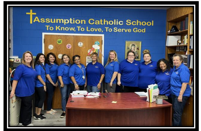
Our ACS Team